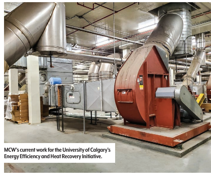
MCW's current work for the University of Calgary's Energy Efficiency and Heat Recovery Initiative.