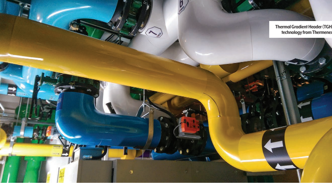
Thermal Gradient Header (TGH) technology from Thermenex.